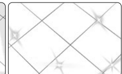
Rinse thoroughly with clean water