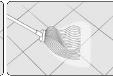
Apply diluted solution to the surface