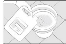
Dilute depending on cleaning requirements