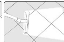
Remove dirty solution with a wet vac then rinse