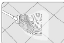
Apply diluted solution to the surface