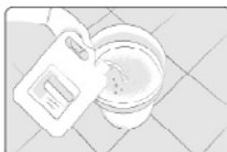
Dilute depending on cleaning requirements