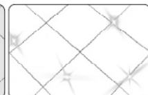
Surface is now clean and disinfected

Note A: Do not use OxiTREAT+ on marble, limestone, travertine or on other acid-sensitive tile or stone.