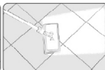
After the appropriate dwell time, scrub surface