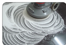
Step 3 Large areas use a low speed scrubbing machine with white pad.