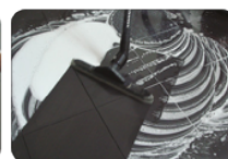
Step 4: Remove dirty solution. A wet/dry vac may be used.