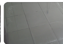
Step 5: Rinse thoroughly with clean water.

Note A: For heavy wax coatings, see PROBLEM SOLVERS 19 - REMOVE HEAVY WAXES AND FLOOR FINISHES