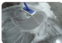
Step 2: Scrub surface using white nylon pad.